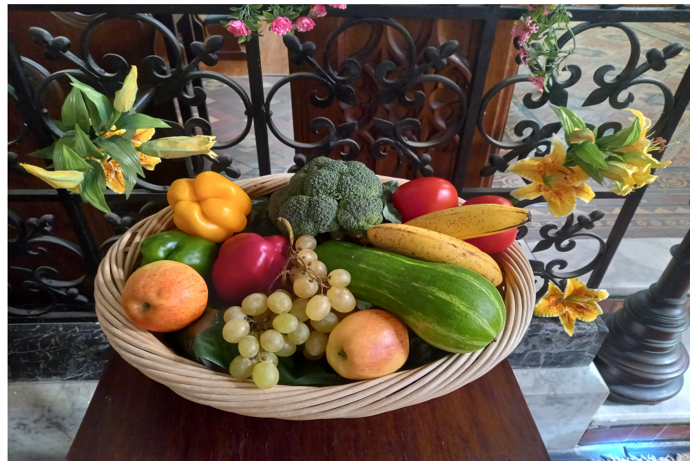
Recent Services - Harvest Festival - Remembrance Sunday

The Church of England invites to Holy Communion all baptized persons who are communicant members of other Churches which subscribe to the doctrine of the Holy Trinity, and who are in good standing in their own church. Those who are prevented by conscience or the rules of their own Churches from receiving the Blessed Sacrament are invited to receive a blessing.